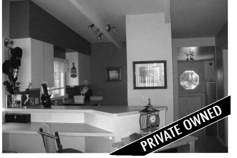
13456 STOVER ROAD, CHARLEVOIX

605 MILL STREET., EAST JORDAN Great intown location for many reason. This home also features a "pole barn" style garage with additional work space in addition to parking. With some updates over the years this home should be on your viewing list for today! MLS 434764. Ask for Mike Stark. $49,900