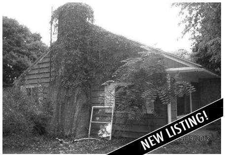
215 PROSPECT STREET, CHARLEVOIX On the outer edges of town, this single story home has a very unique layout. Although in need of cosmetics and some repairs, the potential is there for a great home or investment income. Easy access to the attic area also offers potential for finishing some area for extra play, storage, or sleep. MLS 435009. Ask for Mike Stark. $45.000

This condo is move in ready and the tasteful furniture and furnishings can be negotiated with the sale! Need a place to park your boat? This condo offers that too! With the marina, launch and beach around the corner as well as a restaurant/bar this condo is the perfect getaway. MLS 432854. Ask for Jennifer Burr-Cutler. $86,000