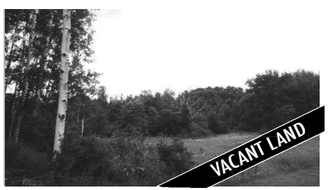
750 SEVENTH STREET, EAST JORDAN This is a beautiful piece of property right on the edge of town. Acreage is on a dead end street and very private. Would make for a perfect walk out basement. City water and sewer are available for hook up. Drive by or call for your personal tour today! MLS 430403. Ask for Jennifer Burr-Cutler. $21,900

110 MARY STREET, EAST JORDAN Nice two bedroom home in town! Would make for a great rental property. Many improvements already complete and just a few more would make this home ready to move into. Already approved from lender as a short sale, bring your offer today! MLS 433025. Ask for Jennifer Burr-Cutler. $19,900